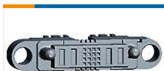
TE Part # 1-1600636-4 MBXL RCPT PMT 3ACP+24S+3ACP